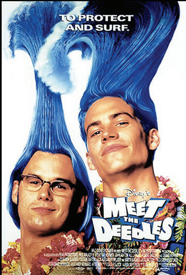
Meet the Deedles US One-Sheet